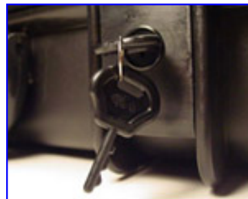
Latches with plastic locks