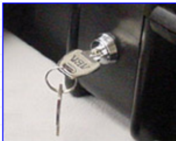
Latches with metal locks