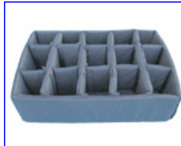
Adjustable Padded Divider