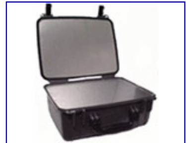
Aluminum Panel Kits